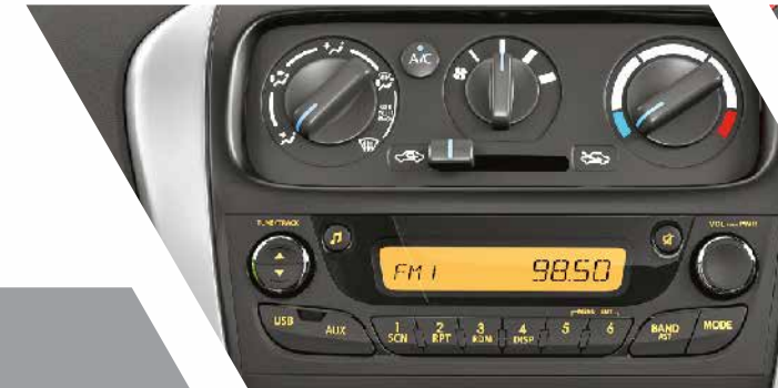
ENTERTAINMENT - Lively Integrated Stereo