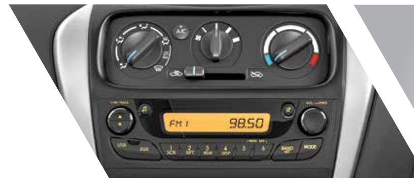
LIVELY INTEGRATED STEREO

Now listen to your favourite songs on the integrated music system or experience the convenience of keyless entry and power windows. The new Alto 800 comes with an array of features that will make you want to take it for a long drive.