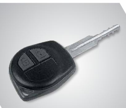
CONVENIENCE - Remote Keyless Entry