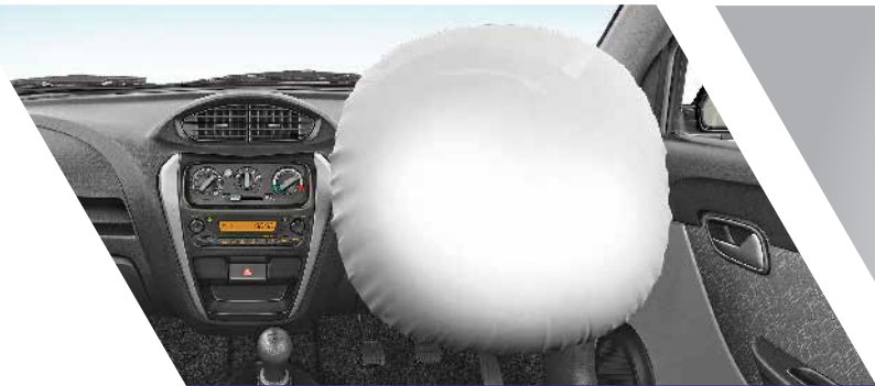
DRIVER SIDE AIRBAG