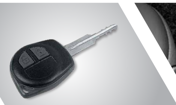
REMOTE KEYLESS ENTRY