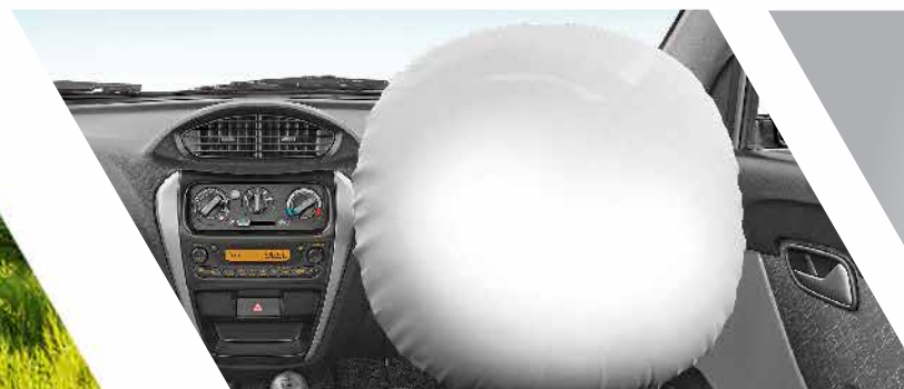
SAFETY - Driver Side Airbag