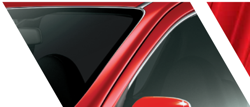
RIGHT AND LEFT HAND ORVM

(O) - Optional Safety Variant is available across the range, starting from the base variant.