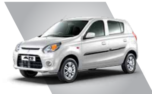
Superior White* ^