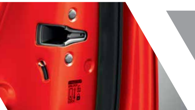
REAR DOOR CHILD-LOCK

The rear child-lock and ORVMs reassure you for a more secure drive.