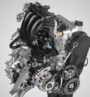
EFFICIENT RESPONSIVE ENGINE

(O) - Optional Safety Variant is available across the range, starting from the base variant.