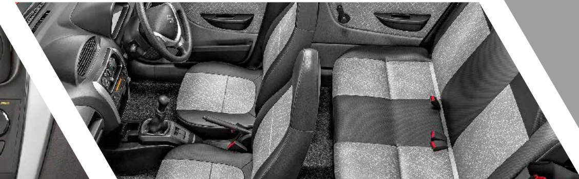
COMFORT - Fresh and Spacious Interiors